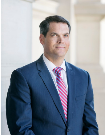
Geoffrey L. Duncan Lieutenant Governor, Georgia

A former professional baseball player and successful entrepreneur, Geoff Duncan was elected Georgia's Lieutenant Governor in November of 2018.