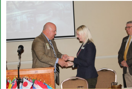
21st Century Partnership Robins Air Force Base